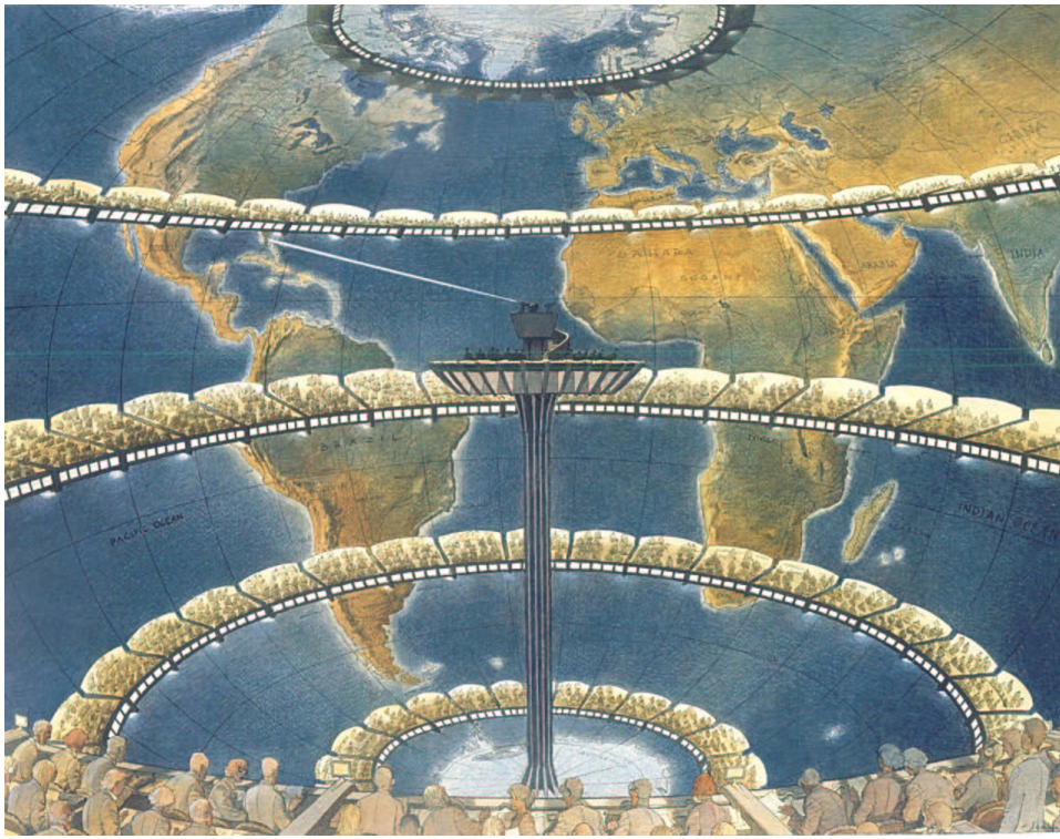
Figure 6. An artist's impression of Richardson's Forecast Factory, described in §11.2 of his book. Richardson estimated that 64,000 'computers' would be needed to keep pace with the atmosphere.