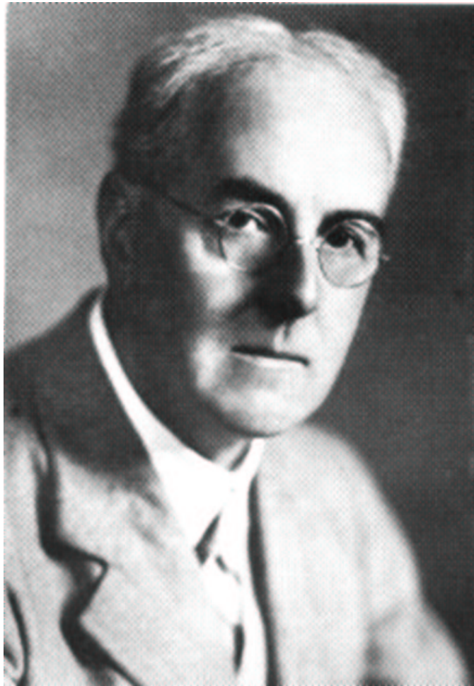
Figure 2. Lewis Fry Richardson (1881-1953). From Richardson's Collected Works

takes to evolve, but concluded that, if only the calculations agreed with the facts, the scientific victory would be won. Meteorology would then have become an exact science, a true physics of the atmosphere. He was convinced that, if the theoretical problems were overcome, practical and applicable methods would soon follow: