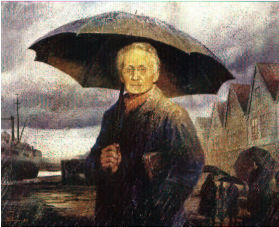
Figure 1. A recent painting (from photographs) of the Norwegian scientist Vilhelm Bjerknes (1862–1951) (original in the Geophysical Institute, Bergen).

The difficulties of forecasting during this period are illustrated by the tragic fate of Admiral Robert Fitzroy. Around 1860, Fitzroy started to issue forecasts and storm warnings for coastal regions, which were published in the London Times. However, with so few observations and such limited understanding of the atmosphere, he had no real hope of success. The forecasts generated considerable hostility and indeed some unjustified criticism of Fitzroy, which contributed to his untimely death.