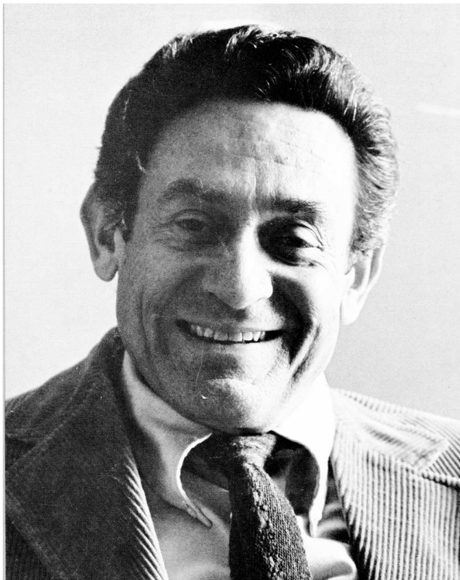
Figure 3. Jule Charney (1917–1981). From the cover of EOS, Vol. 57, August, 1976.